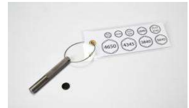
Grommet and lanyard for pull-wand included!