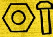
Nuts & Bolts