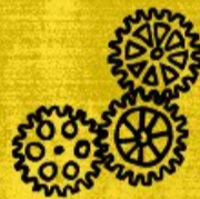
Gears & Machinery