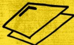
Metal & Plastic Surfaces